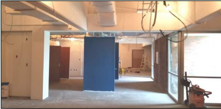
Bldg. 7 Biology Lab Renovation and New Testing Area