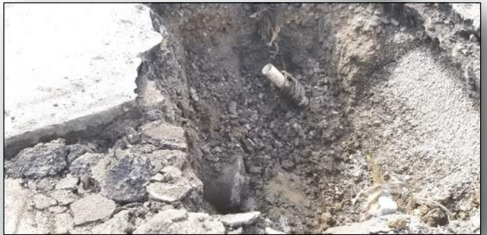
Site Drainage Catch Basin Repair Project