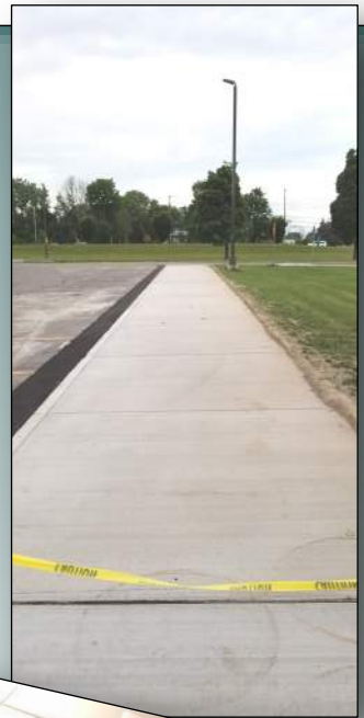
Concrete Sidewalk Replacement Project