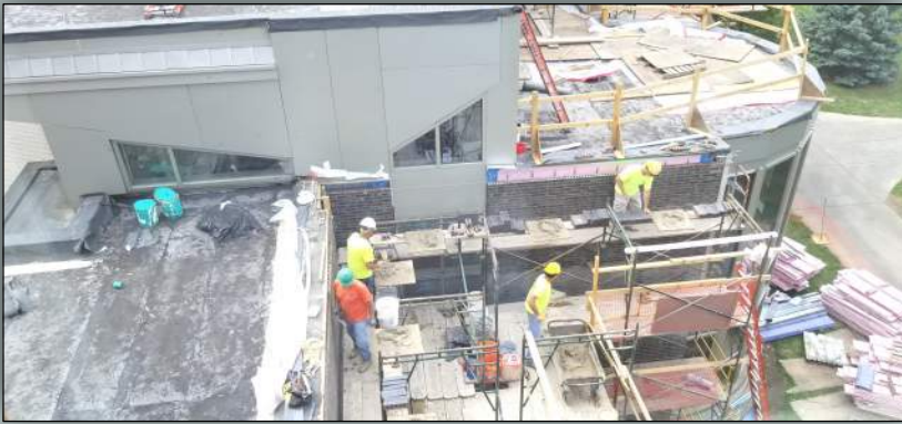
Building II Roof Replacement Project