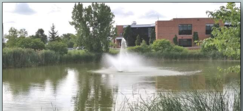
Pond Aerator Project