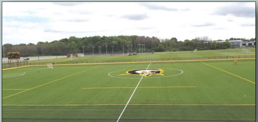
DiMarco Turf Field Replacement