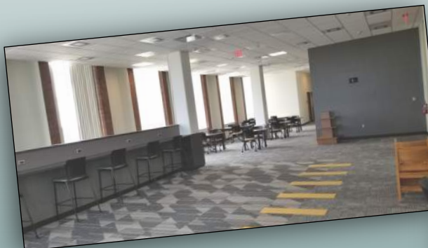
Student Services Renovation and Relocation of Departments