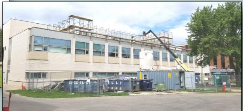
Building II Façade Replacement Project