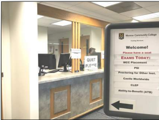
Renovation and Relocation of the Testing Area