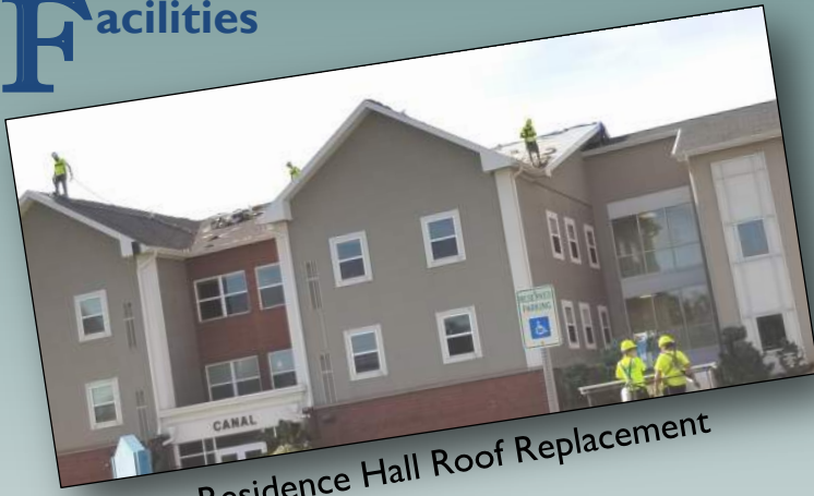
Residence Hall Roof Replacement